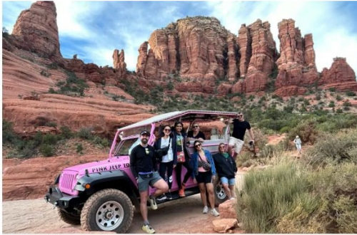
There's plenty of hiking, touring, and observing to do

Tanyel Mustafa Published Dec 7, 2023, 7:00am | Updated Dec 8, 2023, 11:58am WhatsApp X Instagram Facebook