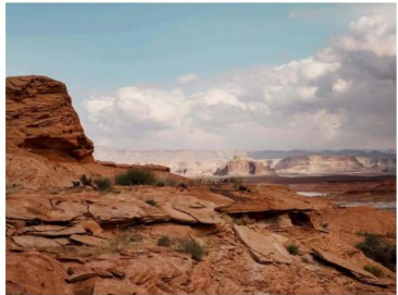
All locations featured in this article are within Diné Bikéyah, Nuwuvi (Southern Paiute), Hopitutskwa, Pueblos, Havasu Baaja (Havasupai) and

The American West has a lot to offer – it seems that multi-colored rocks just spread into the distance for hundreds of miles with endless canyons, mesas and interesting formations. At the heart of this iconic, round the world recognisable landscape is Page, Arizona, one of the best places for adventure lovers to explore what the wild west really means. Read on for our guide for things to do in Page, Arizona, including hiking, best spots for exploring, accommodation and restaurants.