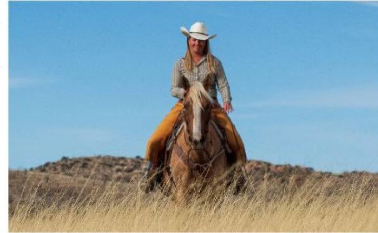
A Dude Ranch stay is 'the original form of nature-based tourism'

One hundred horses and a lone donkey clattered from the corral. Behind them, cottonwood trees burned egg-yolk yellow and the mountains blurred to silhouettes. Hooves drummed and dust scattered. I had been promised a spectacle and this was it.