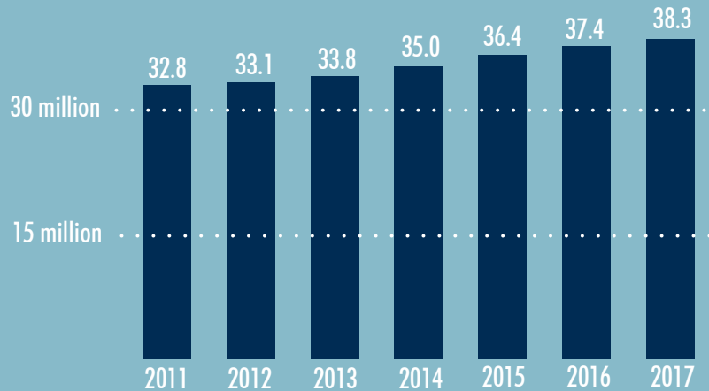
AZ Domestic Visitation Trend